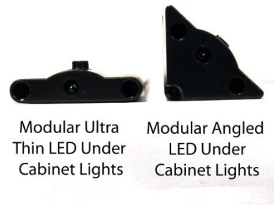
Modular Ultra Thin LED Under Cabinet Lights

EnvironmentalLights.com, a leading online resource for high-quality, energy-efficient LED lighting systems, recently added a premium line of modular LED under cabinet lighting to their growing line of LED under cabinet lighting systems. The Environmental Lights Modular Premium LED under cabinet lighting line features three interchangeable lighting options: Ultra Thin LED light bars, Angled LED light bars and surface mount LED puck lights.